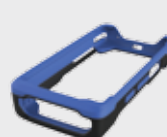
■ 94ACC0132 Rubber Boot