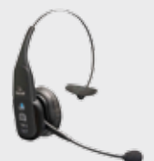
■ 94ACC0127 Bluetooth Headset VXi B350-XT