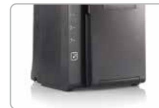
Easy Paper Roll Access

Dressed from head to toe in timeless black or white color, the only trend that never goes out of style, and with stylish touches added throughout, the HS-2410W is not just a piece of machinery, it is an elegantly crafted piece of art that looks right at home in any store decoration.