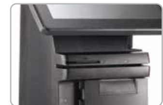
Optional Built-in MSR, Smart Card Reader, Fingerprint Sensor and RFID Reader