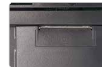
Built-in 2" Thermal Printer